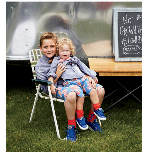
PERFECT PAIRS 1. The brides' sons hung out by the vintage Airstream, which was filled with snacks and games for the kids—and just the kids, as the sign denoted. 2. Laser-engraved wood covered the programs. 3. The couple wed in front of a canvas scroll custom-printed with a quote from the 13th-century poet Rumi.