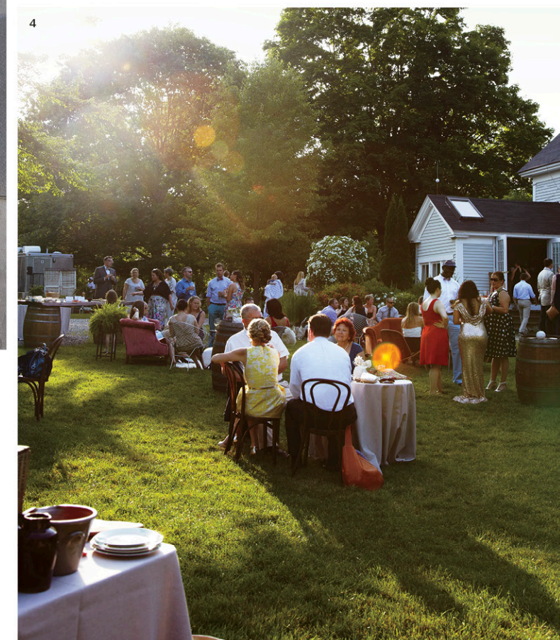
PARTY STARTERS 1. Burlap bags, stocked with provisions, a "hangover kit," and the weekend's itinerary, welcomed guests. 2. Artisanal liquors, whiskeys, and local bitters were on offer at the bar. 3. Die-cut escort cards printed with guests' names and a map of Portland hung from a wall on the barn's facade. 4. With their flower-girl duties completed, Lauren's nieces guarded the "No Grown-Ups Allowed" Airstream. 5. Among the six made-to-order cocktails available, the basil gimlet (center) was the biggest hit.